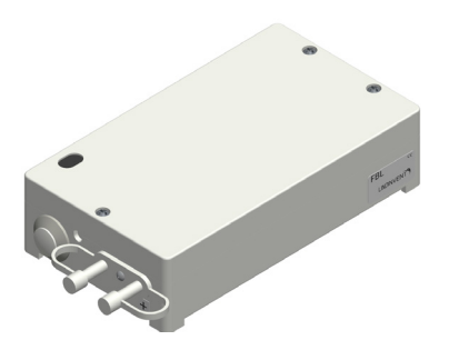
FBL - Airflow controller.